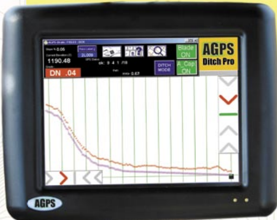
Zynx X20 controller with profile view

The AGPS Ditch Pro System can plug into a GPS RTK steering system in minutes!